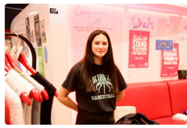
Re.drobe - On Trend Secondhand Clothing