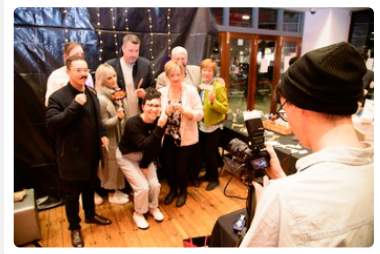
Snap - Affordable Mobile Photobooth