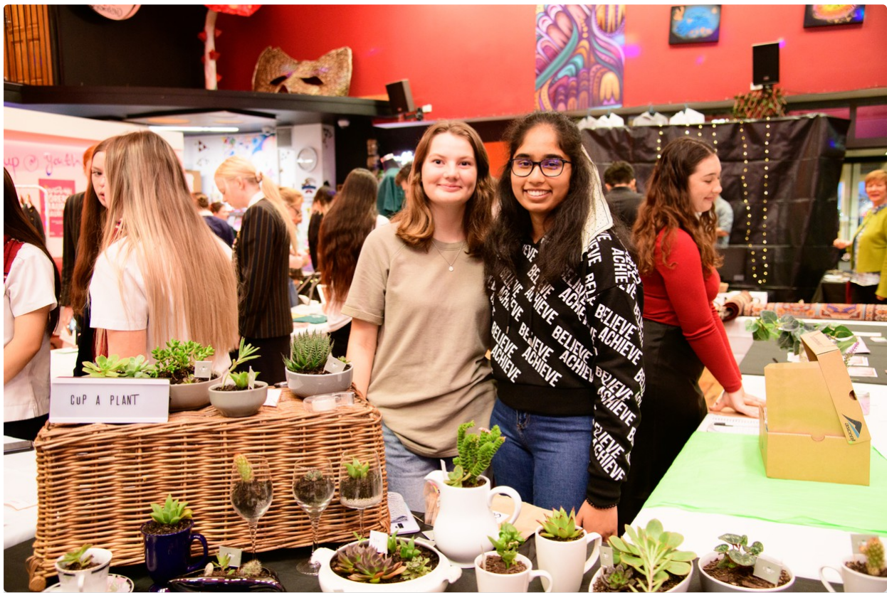
Cup A Plant - Repurposed mugs and bowls as pots for succulents