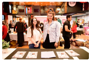
Rose Petals: Rosewater Facial Toner